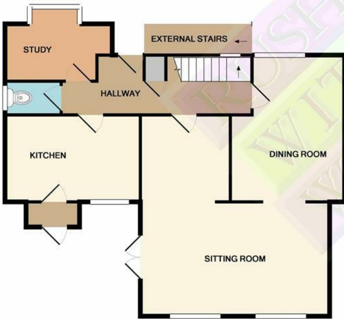
1ST FLOOR APPROX. FLOOR AREA 852 SQ.FT. (79.1 SQ.M.)